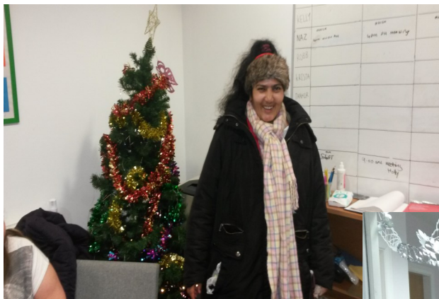
Service user and staff at the Christmas party